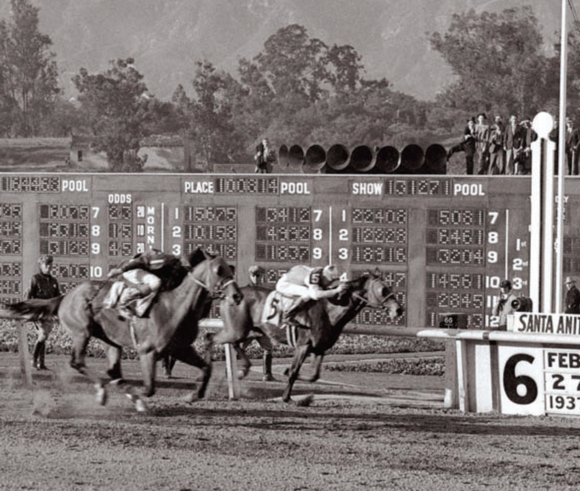
Rosemont edges out Seabiscuit to win the Santa Anita Handicap by a nose.