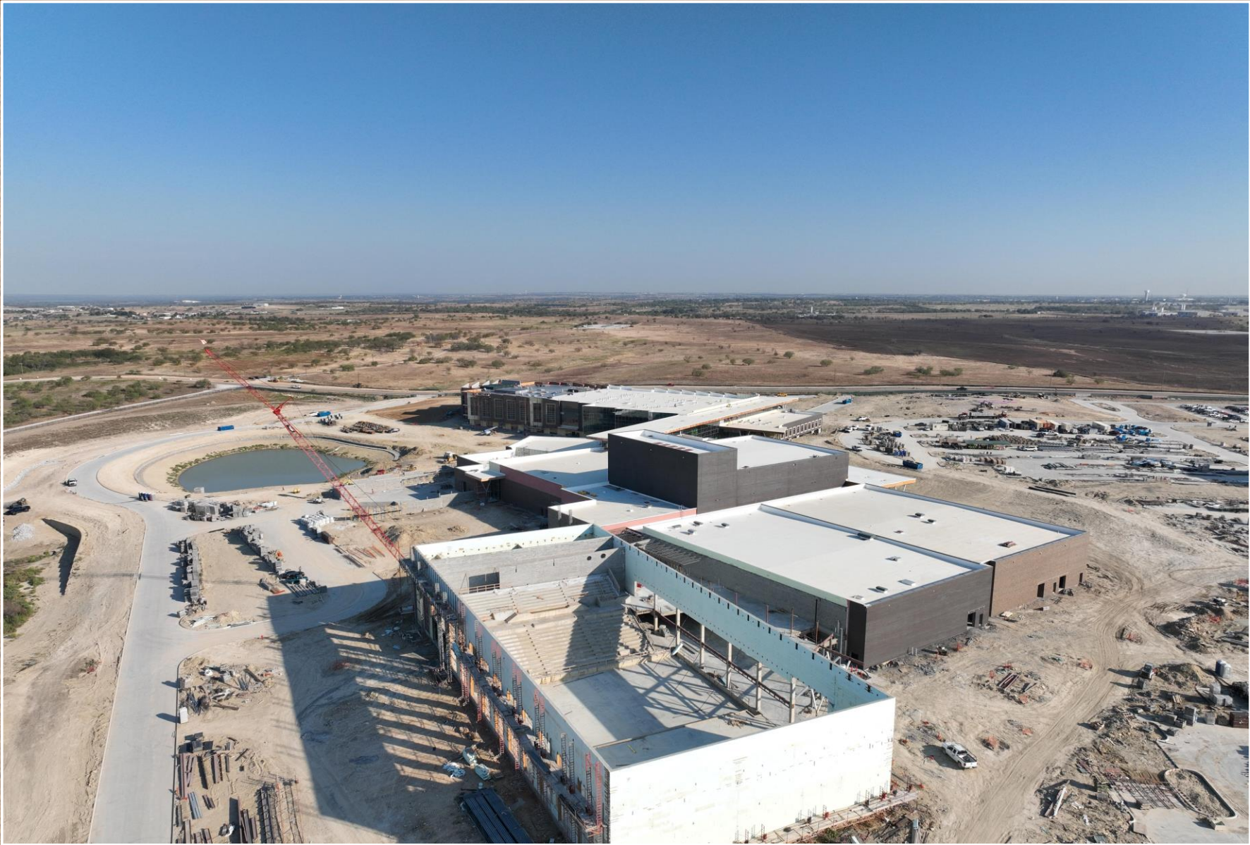
Aerial photo of the building facing north.