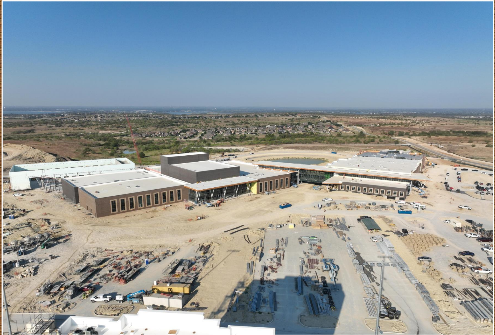
Aerial photo of the side of the building facing west.