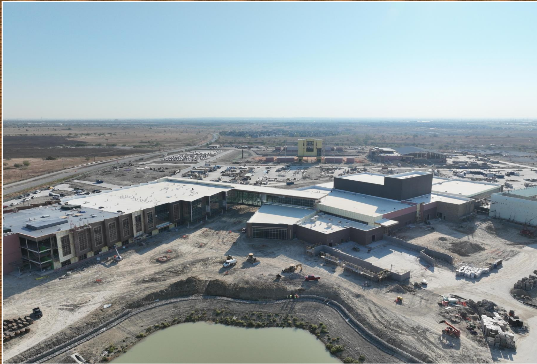
Aerial photo of the side of the building facing east.