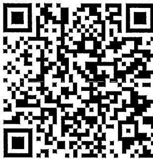
QR Code For Online Forms